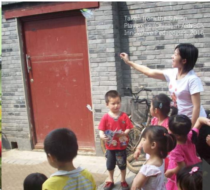
Taken from the Sihuan Playgroup (China) in ARNEC's Innovative Pedagogies, 2016