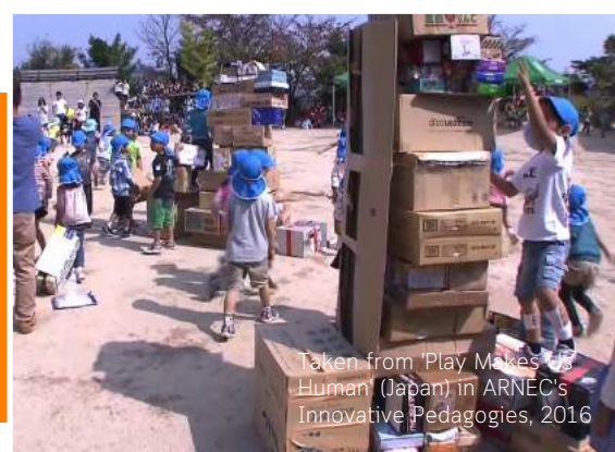
Taken from 'Play Makes Us Human' (Japan) in ARNEC's Innovative Pedagogies, 2016

Help us document and promote more noteworthy ECD practices in the Asia-Pacific, and together protect, uphold, and promote the rights and well-being of young children in the region.