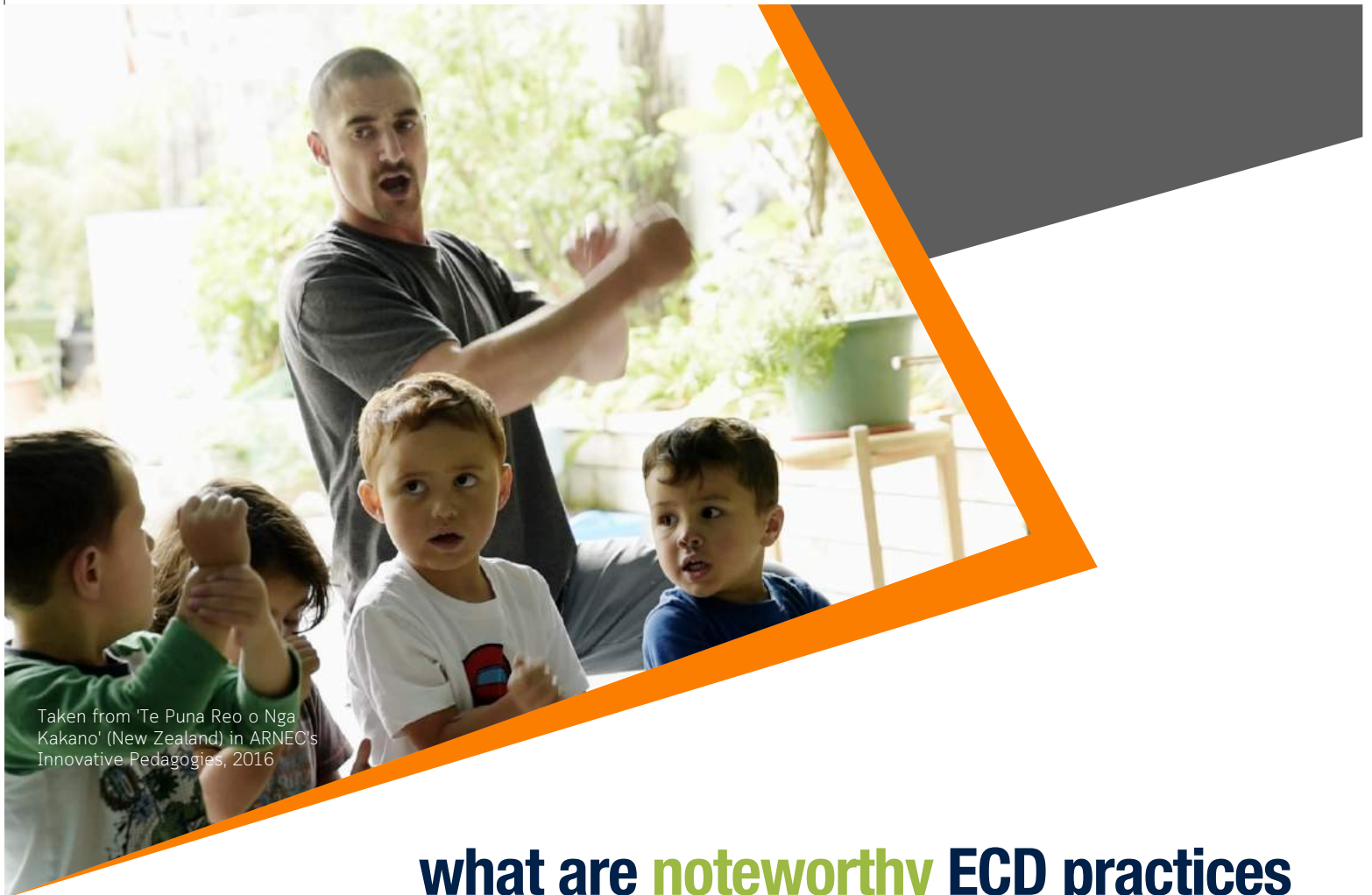
Taken from 'Te Puna Reo o Nga Kakano' (New Zealand) in ARNEC's Innovative Pedagogies, 2016