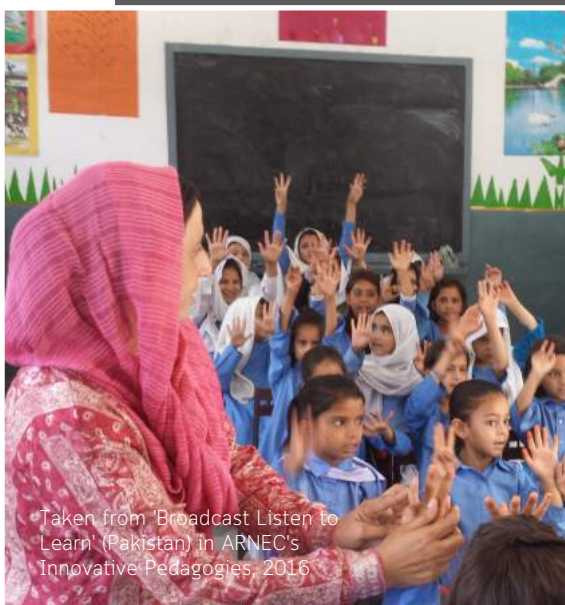
Taken from 'Broadcast Listen to Learn' (Pakistan) in ARNEC's Innovative Pedagogies, 2016